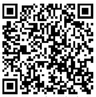
Scan QR code with phone

Multi-storey car park at the University of Leeds is open to the general public after 5pm. Up to two hours costs £2. <a href="http://carparking.leeds.ac.uk/directions-to-campus/">http://carparking.leeds.ac.uk/directions-to-campus/</a>